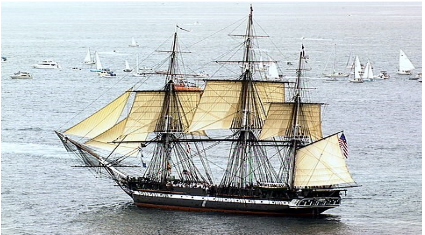
USS CONSTITUTION (IX-21) THE OLDEST COMMISSIONED WARSHIP AFLOAT AND THE NATION’S SHIP OF STATE ON HER ANNUAL JULY 4TH “TURN AROUND” IN BOSTON HARBOR

Spring/Summer 2024 WWW.USSBANG.COM WWW.FACEBOOK.COM/USSBANG ISSUE-108